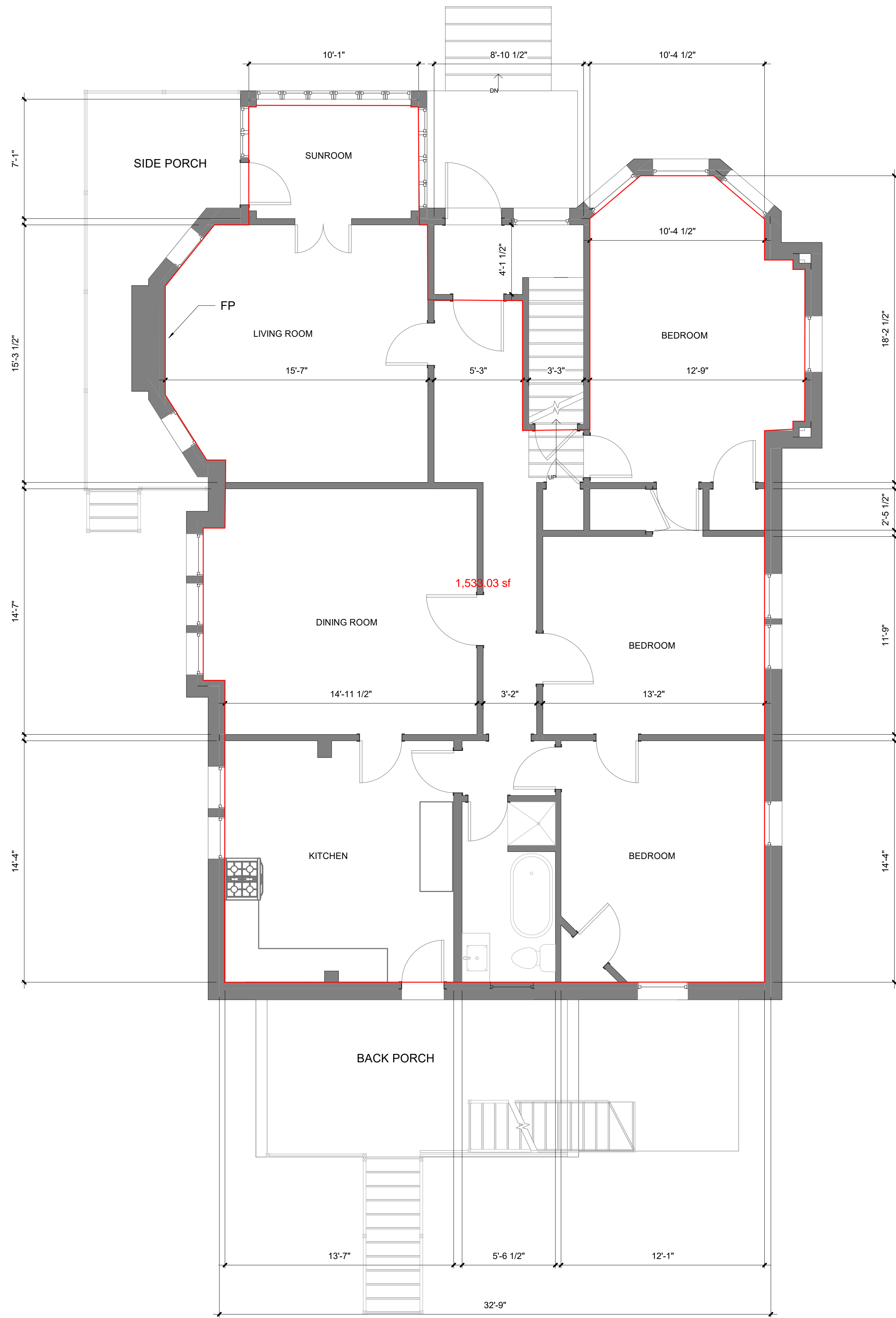
2 1ST FLOOR 1/4" = 1'-0"