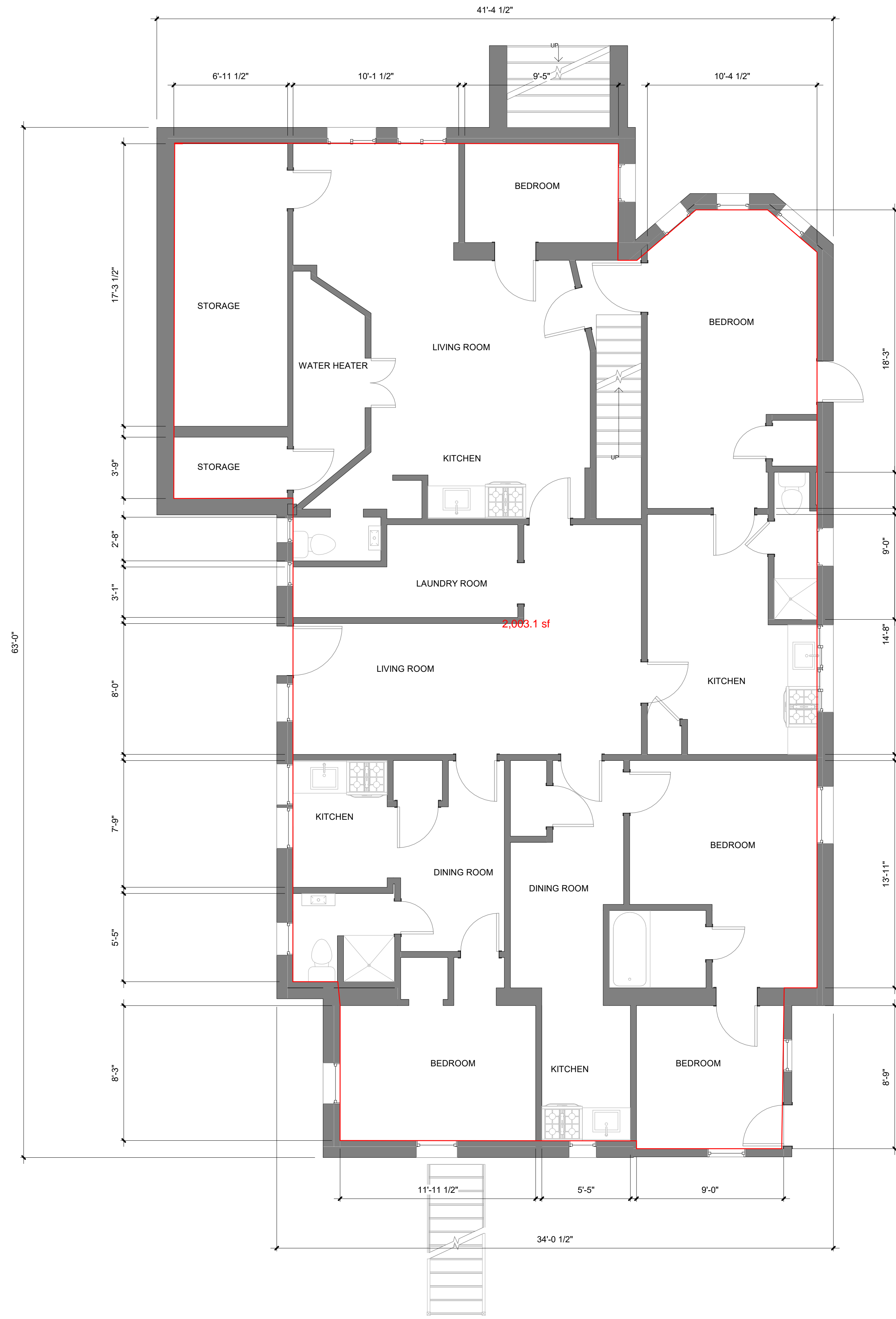
1 CELLAR PLAN 1/4" = 1'-0"